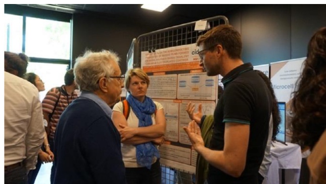
Lively discussions during the poster session.